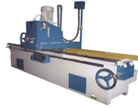
KNIFE (BLADE) GRINDING MACHINE