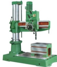
RADIAL DRILL MACHINE