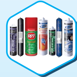
Adhesive & Sealant