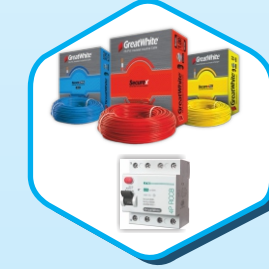
Wire & MCB