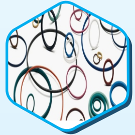
O Rings & Quad Rings