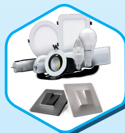
Switchgear & LED