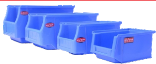
FRONT PARTLY OPEN (FPO) BINS - 15,25,35,45

✉ sales@ritaplasticcrates.com 🌐 www.ritaplasticcrates.com