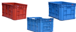
FRUIT & VEGETABLE PLASTIC CRATES