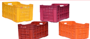
FRUIT & VEGETABLE PLASTIC CRATES