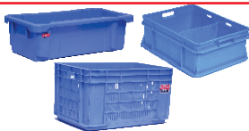
Dairy Crates:10 ltr./12 ltr./Icecream Crates