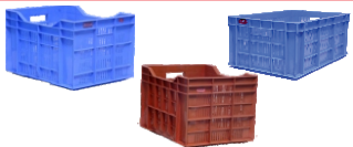
FRUIT & VEGETABLE PLASTIC CRATES