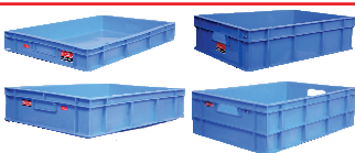
600x400 Series : 080/120/150/175