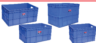
600x400 Series : 285/320/375/425/485