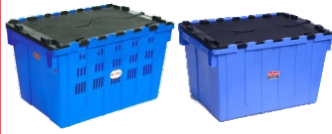
CONTAINER WITH LID

OUR PLASTIC CRATES ARE WIDELY USED IN FOLLOWING SECTOR :