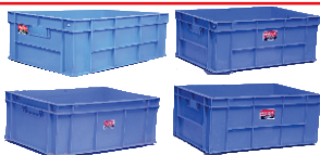
600x400 Series : 200/220/225/245