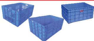
650x450 Series : 315LW / 315HW / 315A