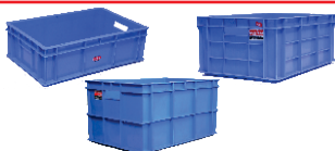
500x325 Series : 100/150/200/250