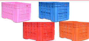
FRUIT & VEGETABLE PLASTIC CRATES